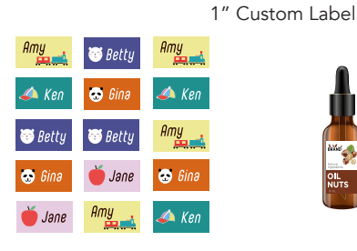
Name Sticker Esse